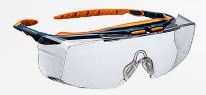
PS24 - PEAK OTG SAFETY GLASSES